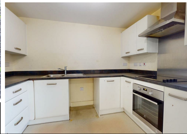
Selway House, Frome Road, Radstock , BA3 3FL